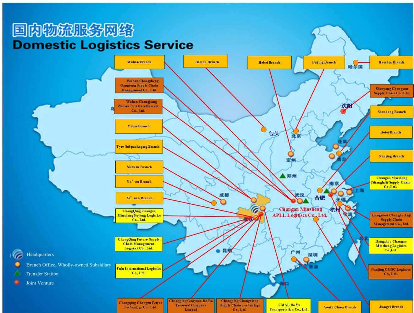
Picture 2: Location of the Company's existing branches, subsidiaries, associated compaies and representative offices

As at 31 December 2022, the Company had a total of 29 branches, subsidiaries, associated companies and representative offices, which are mainly located in East China, Central China, North China, South China and Southwest China (Picture 2). The continuous enhancement of service network enables the Group to provide logistics services to different parts of the country.